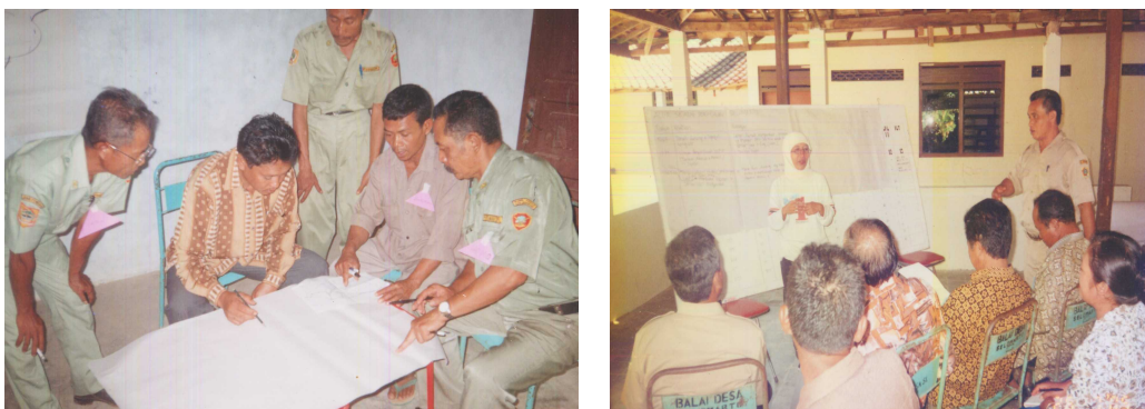
Figure 2 Participatory rural assessment process in the designated villages

Analyses model used in this study is stratified qualitative model. In the first level, some fact finding in the village levels would be classified into problems, potentials and solution chosen by the community. The identified problems then ranked by three criteria: felt by common people, urgent to solve, and availability of self reliance to do. From this matrix, then drafted to the Village Action Plan on Soil Conservation. In the second level, some fact finding every village analyzed and correlated with the sub watershed context in which the villages are located. Then, in the third level, some problems and potential that met during the study brought into to the sedimentation countermeasure in the Wonogiri Multipurpose Dam and Solo Watershed. By this model of analyze, the problem of sedimentation could be considered sharply in their locus, and context with other factors that affect sedimentation.